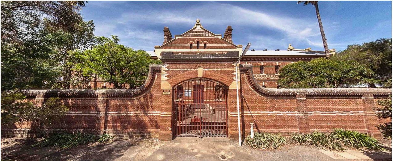
Gates to Z-Ward : Prison for the Criminally Insane - Adelaide, South Australia