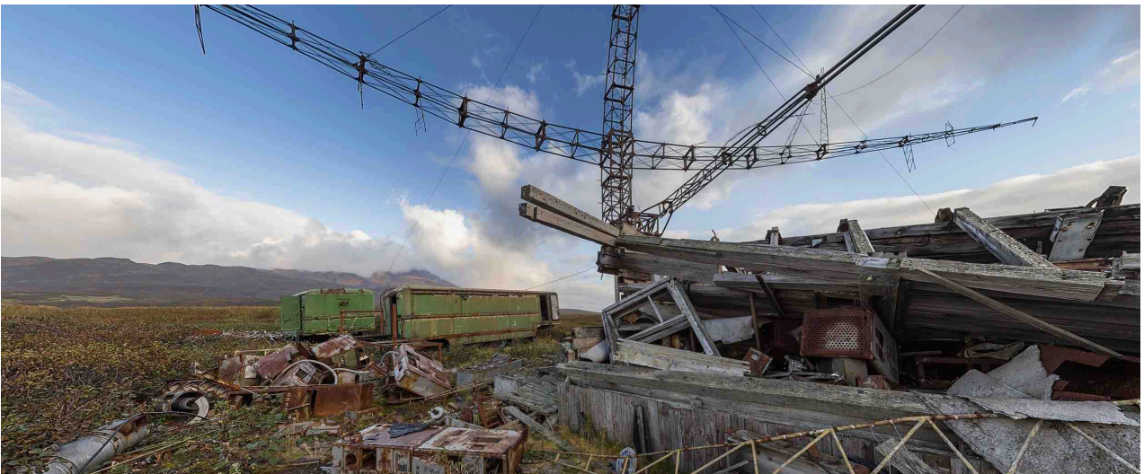
Radar Installation : Abandoned Military base - Matua Island, Sea of Oshkosh